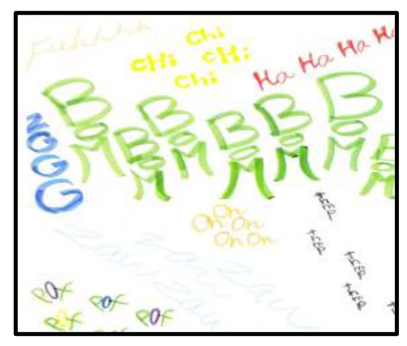
Figure 1. Words in Freedom poem: "Jungle". (S. Yamamori, S. Yamauchi & S. Takeuchi, personal communication, 2012; see also Sullivan, 2014b)

The beginning of semester two continued the poetic theme. Students made a "Words in Freedom" poem in pairs (see Figure 1). Words in Freedom is an Italian Futurist idea from the early twentieth century. The founder, Marinetti, wished to create a new language, free from grammar and syntax (MoMa, 2009). His poems reflect this. Words in Freedom are based on onomatopoeia and typography, and this form of poetry was selected because sound is an almost universal experience and easily accessible in concept. Further exploration of the Words in Freedom poems can be found at Sullivan, 2014b.