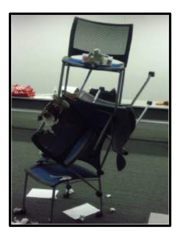
Figure 3. Gutai poem, (C. Ishihara, S. Kuroda, M. K. Kang, Y. Z. Zhao, personal communication, 2012).

reflection of different outlooks through their creative work. They create in similar ways to those who have gone before them. Power is gained in knowing they can do this, and knowing they have the freedom to do so (Disney, 2014, p. 3). For example, Figure 3 shows a pile of chairs one upon the other. The students of a Gutai/Fluxus group strew paper figures at the base of the structure, leaving one figure precariously atop. When asked about meaning, they said it represented the pressures of society. When asked why or how it was a poem, they replied, "We believe the Gutai idea that not all poems are written" (C. Ishihara, S. Kuroda, M.K. Kang, Y. Z. Zhao, personal communication, 2012). They became experts in the classroom in their area of study to some degree, as opposed to novices (as defined by Duff, 2005, p. 56), and illustrated this through their creative work. Their reasoning was very clear to me and to their classmates, which, in addition to illustrating learner agency, again tied into general MEXT aims of wanting students to be able to express and support their opinions and ideas (Committee to Discuss Development of Language Ability, translated in Yoshida, 2009, p. 3).